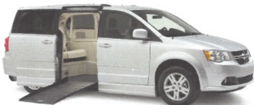
Dodge CompanionVan® Plus (CP)